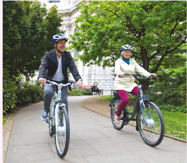
Studying the link between cycling and wellbeing

Prior to taking part, your riding ability will need to be checked by a qualified trainer accredited under the government's nationally-recognised Bikeability scheme (see bikeability.dft.gov.uk ). If you need support, Bikeability trainers will offer free cycle training to improve your confidence and skills sufficiently to take part in the study.